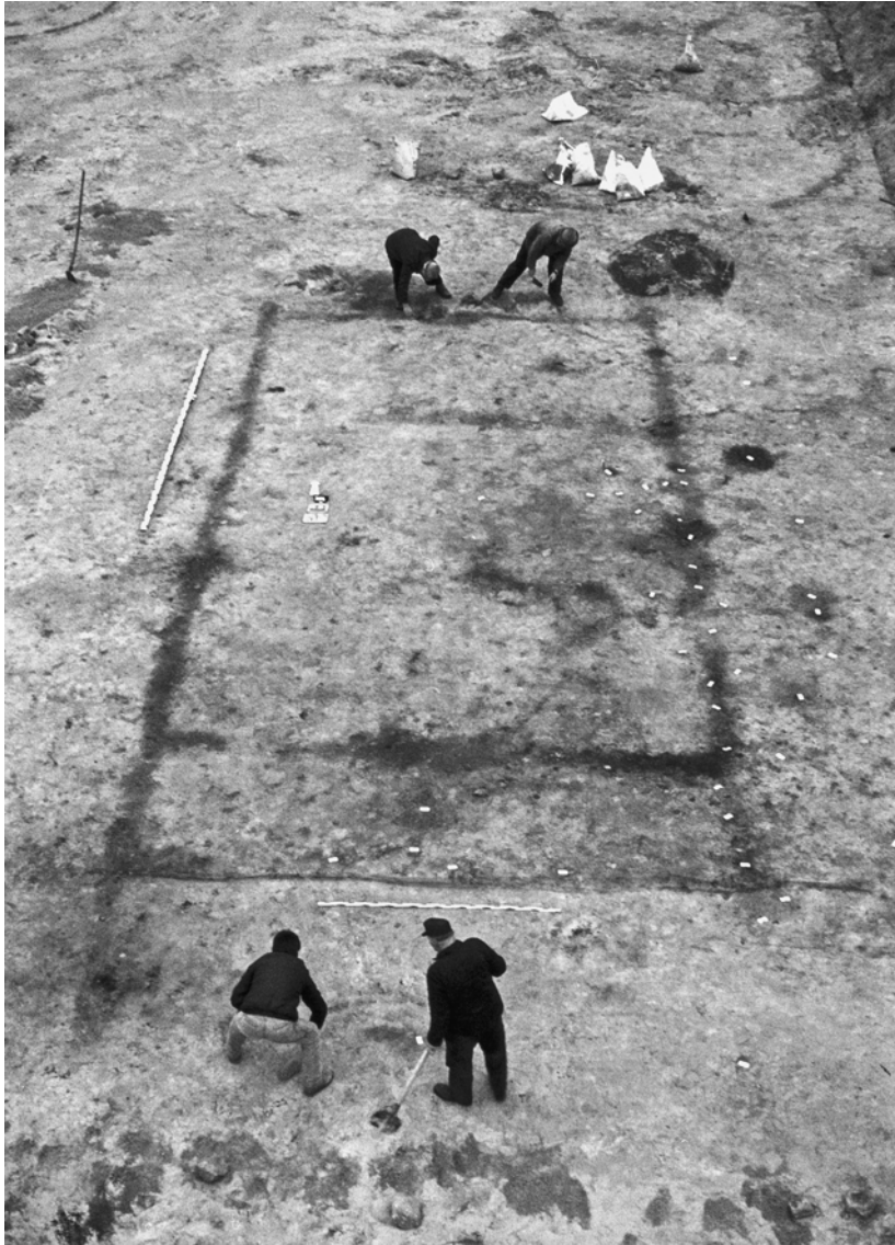
Figure 11.2 Overview from the south of Funnel Beaker Culture house 2 from Flögeln-Eekhöltjen.

removed, can be interpreted as a bedding pit, dug during the construction of house 2, for erection of a standing stone just outside of the northeast corner of the house. This is reminiscent of the high guard stones at the end of (FBC) megalithic graves, as well of parallels in Denmark and Kujawien, Poland (see further discussion in Zimmermann forthcoming).