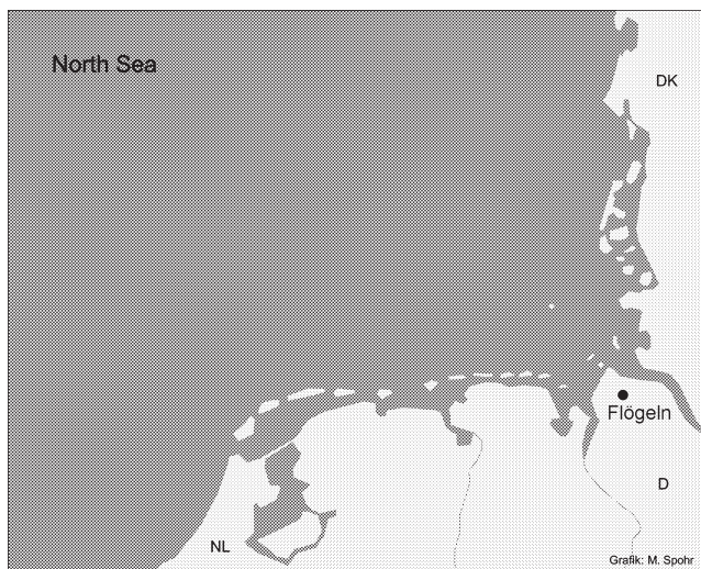
Figure 11.1 Map of location of Flögeln in the area south of the North Sea.

From 1971 until 1986 the Lower Saxony Institute for Historical Coastal Research (NIhK) in Wilhelmshaven conducted the research project ‘Evolution of an Inhabited Isle since Neolithic times with special regard to economic conditions’. It was funded by the German Research Council (DFG) in order to study the evolution of settlement and its economic background over five millennia on the inhabited isle of Flögeln, district of Cuxhaven, Lower Saxony (fig. 11.1) (Behre/Kučan 1994; Zimmermann 1992; 1994). As part of this project, three structures from the Neolithic Funnel Beaker Culture period (FBC) were excavated, two of them long houses and one a sunken-featured building. The function of the latter, which is not discussed here, is interpreted as to be cultic; we think it is comparable to the FBC-culthouses south of the Limfjord in Jutland, DK (Becker 1997). The excavation results for the Neolithic and Bronze Age features are being analysed, and they will be published in the near future, as will the Neolithic and Early Bronze Age pottery which has been analysed by Jan Albert Bakker (Bakker in prep.).